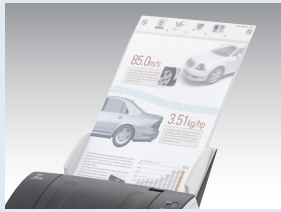
A3 Carrier Sheets

* Carrier Sheets (5 sheets per set) can be purchased separately. (The Carrier Sheet should be replaced approximately every 500 scans)