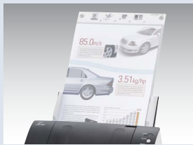
A3 Carrier Sheets

* Carrier Sheets (5 sheets per set) can be purchased separately. (The Carrier Sheet should be replaced approximately every 500 scans)