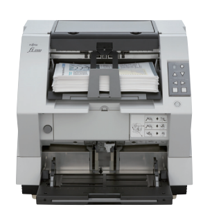
A4 Landscape at 300 dpi 135 ppm / 270 ipm A4 Portrait at 300 dpi 105 ppm / 210 ipm Scan mixed batches through the 500 sheet hopper