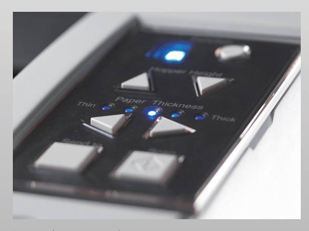
Integrated operating panel